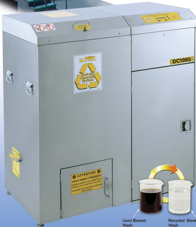
Used Blanket Wash