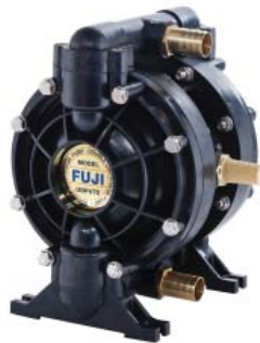
UDP5TA 13.2 GAL/MIN (50 L/MIN)