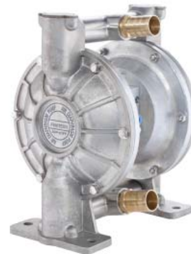
UDP6TA with optional stainless steel body 15.9 GAL/MIN (60 L/MIN)

Compact, reliable Uni-ram dual diaphragm pumps transfer many types of fluids used in industry including water based liquids, ink and solvents such as varsol and thinners. Fluids are used for many purposes including cleaning industrial parts and equipment. In this application, Uni-ram diaphragm pumps are ideal for transferring clean solvent to the cleaning site and returning used solvent to a reservoir.