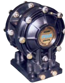
UDP4TA 3.7 GAL/MIN (14 L/MIN)